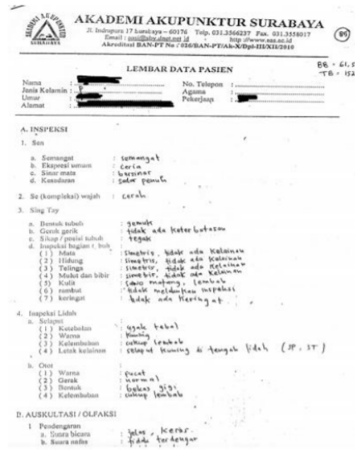
Figure 4. A Patient datasheet

Meanwhile, Table 6 indicates the simulation result of nine patients with ID P17, P21, P28, P31, P40, P44, P53, P78, and P85. The simulation result to determine the syndrome differentiation of patients with ID P17 is lung yin deficiency (S5). Because the highest of the alternative preference values ( V_i ) is a V_5 with a value of 3.01. For patients with ID P21, P28, and P31, the simulation results indicate the syndrome differentiations are lung qi deficiency (S4). For patients with ID P40, P44, and P53, the simulation results indicate the syndrome differentiations are the accumulation of heat in the lungs (S2). For the patient with ID P78 and P85, the simulation results indicate the syndrome differentiations are retention of moist phlegm in the lungs (S3). Table 6 also indicates a comparison between simulation results of Fuzzy MAGDM versus a TCM physician diagnoses manually. The comparison shows that the simulation results of Fuzzy MAGDM versus a TCM physician diagnosis conventionally are the same. The research results showed that the utilization of Fuzzy MAGDM to determine lung differentiation syndrome was running well.